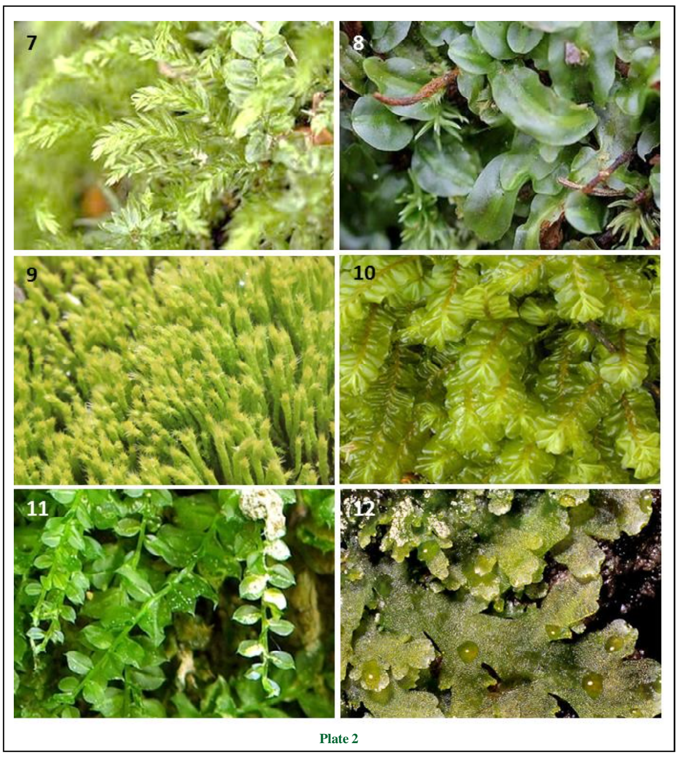
Figures 7-12:7. Mnium sp.; 8. Pallavicinia lyelli; 9. Philonotis fontana; 10. Plagiochila sp.; 11. Plagiomniuni sp.; 12. Riccardia sp.