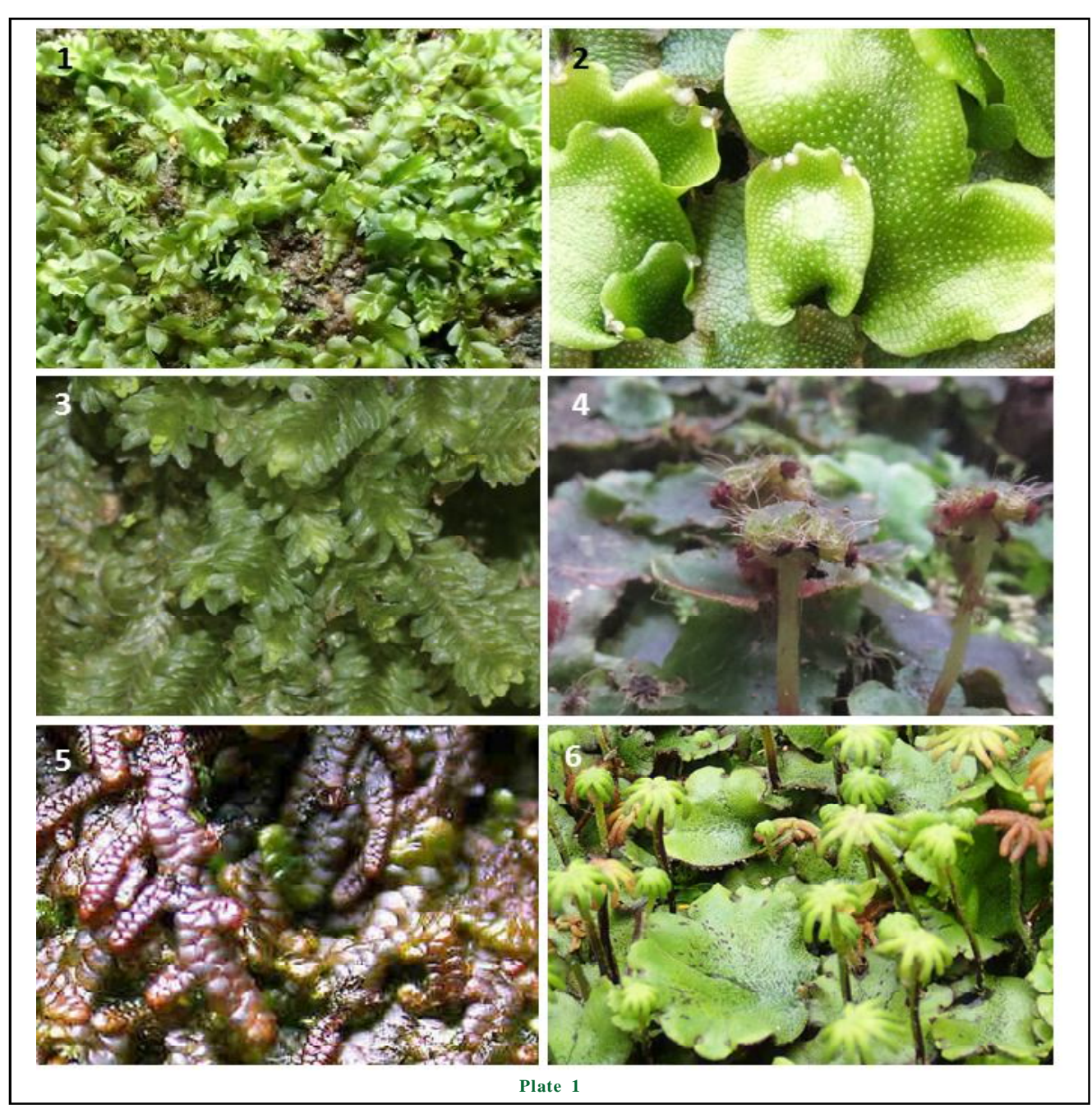
Figures 1-6: 1. Chiloscyphus polyanthus; 2. Conocephalum conicum; 3. Diplophyllum albicans; 4. Dumortiera hirsuta; 5. Frullania tamarisci; 6. Marchantia polymorpha.